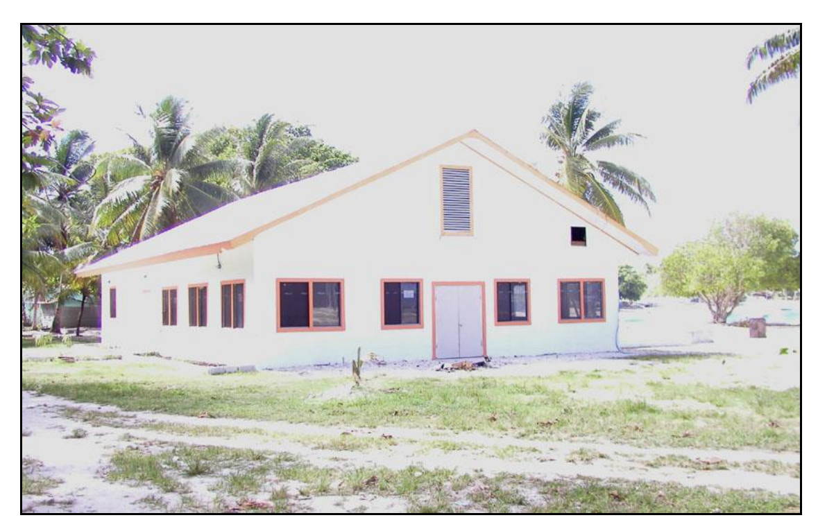
Community Hall In Likiep Village