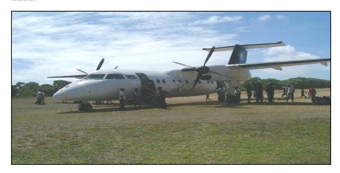
Air Marshall Islands DASH 8 at Likiep Airport

Air Marshall Islands has two weekly flights to Likiep. The schedule normally runs on Monday and Friday via Majuro/Woja/Likiep/Kwajalein with return on the DASH 8. One of the improvements in terms of having modern goods on the island is the frequency of flights. One can receive mail or cartons of boxes filled with such items as canned meats, rice, sugar, soy sauce, tea, and coffee from relatives in Majuro and Ebeye. The regular flights are also important for establishing Likiep as an outer island destination for tourists.