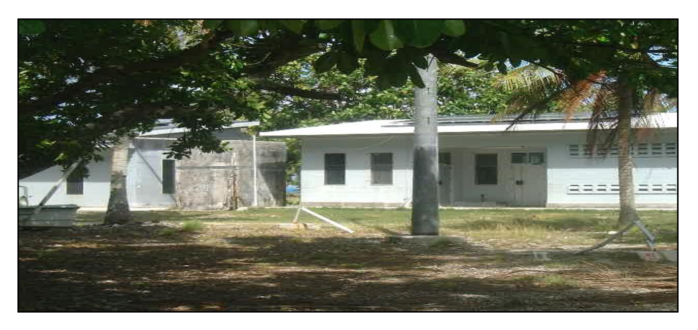
MIMRA Likiep Fish Base Complex

The MIMRA fish base is located in the central part of Likiep village. A giant clam hatchery project is located on Loto Island, an inhabited island close to Likiep Island. A new hospital center is also located near the Fish Base.