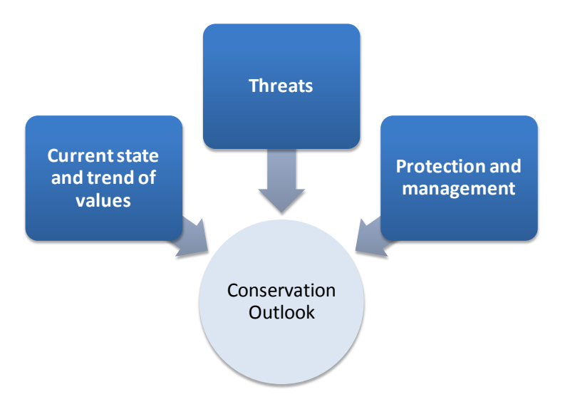
Figure 1: The Conservation Outlook Assessment framework. Conservation Outlook Assessments are a projection of the potential for a natural World Heritage site to conserve its values over time.

Data Deficient: Available evidence is insufficient to draw a conclusion