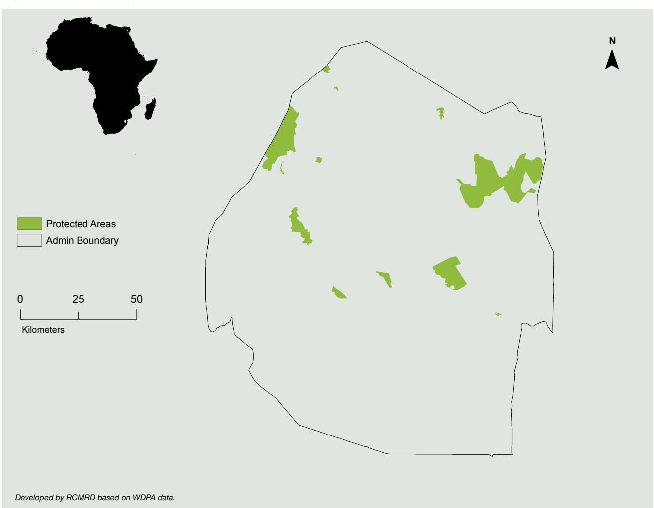
Figure 8.12 Eswatini protected areas